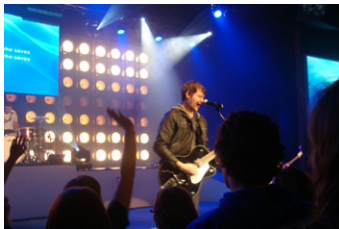
The Great Romance

The Great Romance is a modern worship/rock band from St. Louis that travels the country spreading the gospel of Christ through music and more. Their music flows out of the knowledge that the greatest relationship anyone can have is with their Lord and Savior Jesus Christ, and it is their mission to share that message with the world.