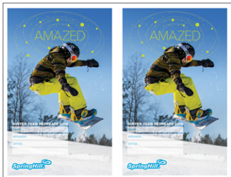
Customizable Postcard Handout

The postcard, when opened in Adobe Reader, allows you to click and type in the name of the band, speaker, and date to customize this poster to your ministry. The bottom box can be used for special messages (i.e., room 321).