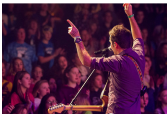
Sing Love Worship

Sing Love is a group of worship leaders from all over the country. Sing Love can look and feel very differently from one event to another, but what remains true about the band is wherever they go they will glorify the name of Christ with every chance they get.