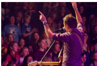
Sing Love Worship