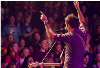
Sing Love Worship

Sing Love is a group of worship leaders from all over the country. Sing Love can look and feel very differently from one event to another, but what remains true about the band is wherever they go they will glorify the name of Christ with every chance they get.