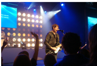
The Great Romance

The Great Romance is a modern worship/rock band from St. Louis that travels the country spreading the gospel of Christ through music and more. Their music flows out of the knowledge that the greatest relationship anyone can have is with their Lord and Savior Jesus Christ, and it is their mission to share that message with the world.